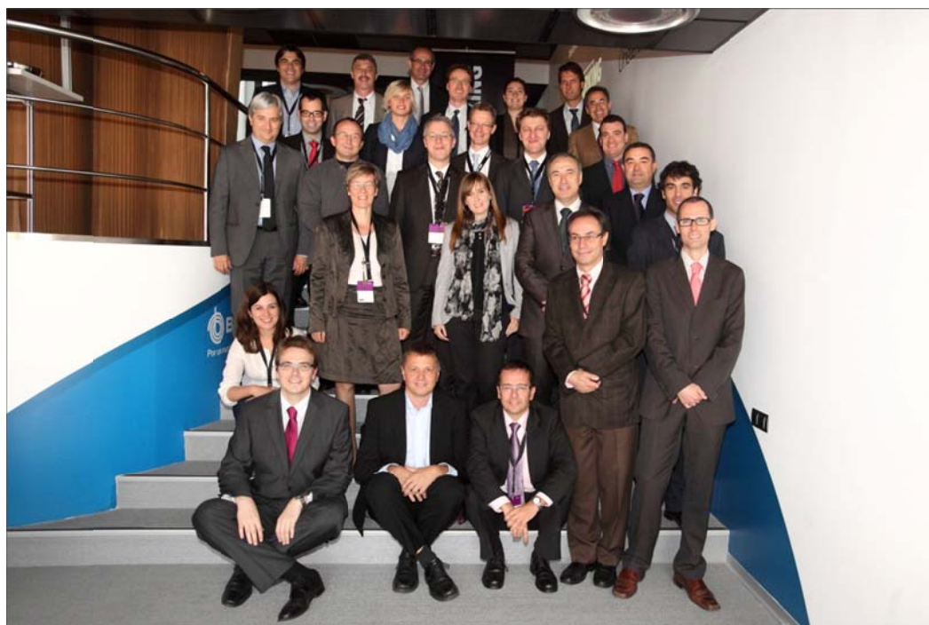
Picture 3 - Official picture with all the representatives