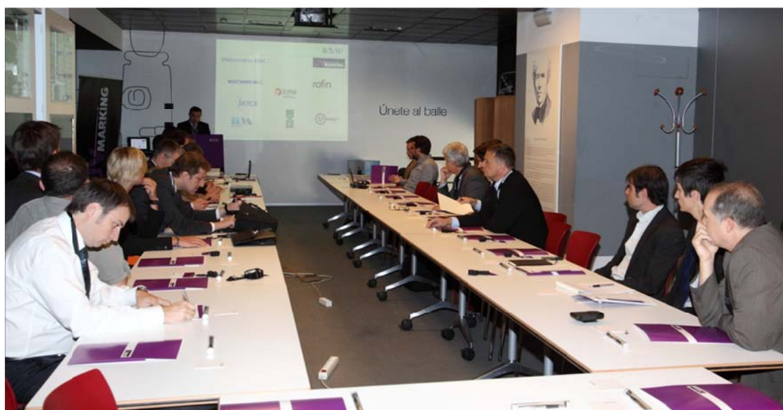
Picture 2 - Some of the attendees to the meeting