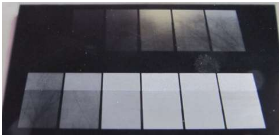
FIGURE 3 – PICTURE OF A GLASS-CERAMIC SAMPLE MARKED WITH UV-LASER

In summary, the UV-Marking project is progressing according to schedule and significant steps have been achieved towards its final goals. In the next months, WP6 integration and industrialization will become fully operational. Below is shown a picture with one of the glass-ceramic samples used during the project marked with UV laser using different parameters: