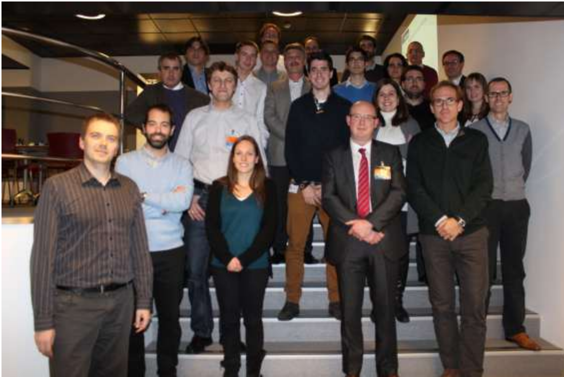
FIGURE 2 – IMAGE OF THE 3RD CONSORTIUM MEETING

in relevant issues and they have been in charge of the communication with the European Commission. Below is shown a photo of the 3 rd consortium meeting: